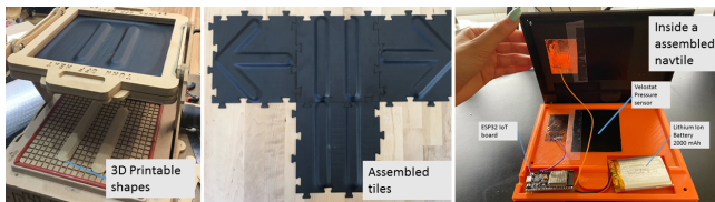
Figure 4: (A) Shows 3D printable textures and a thermo-former for making a texture, (B) Shows guidance surfaces inter-locked with each other (C) Underlying electronics, a sensor to make the tiles multi-modal.

accessibility experts. Our study uncovered the role of tactility in everyday navigation and attitudes surrounding the use of tactile guidance surfaces for non-visual navigation. Our findings indicate that tactile cues although are very important and useful remain inconsistently applied in the built environment and potential breakdowns happen.