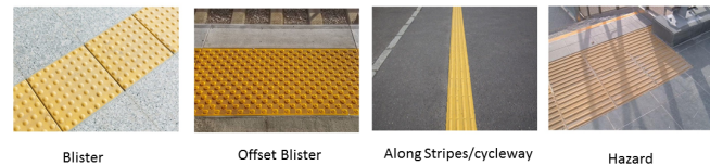
Figure 2: Shows most commonly used tactile guidance surfaces for non visual navigation

A summary of responses (n=67) for the frequency of encounters for each variation of tactile surfaces is given in Table 1. The table also summarizes the understanding of each surface. We asked participants to describe the type of information texture patterns were meant to convey. We counted responses that match the purpose outlined by the ISO standard for tactile surface indicators as understanding the meaning of the surface.